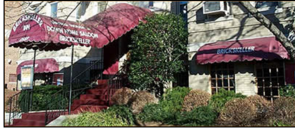
The Brickskeller on Dupont Circle: A common hangout for the Ruritanian Ambassador.

Václav od Plzeňa is the Ruritanian Ambassador to the United States, occupying the Ruritanian Embassy on Massachusetts Avenue, next to the Embassy of the Republic of Ireland. Unfortunately, His Excellency is not much help; he can usually be found at the Brickskeller (a bar) on Dupont Circle about two blocks from the Embassy. As it currently stands, our information comes from only two places: the official, state-run newspaper of Ruritania ( Řuritě Noviny ), and a group of 15 Ruritanian émigrés, who were exiled to Amsterdam from Ruritania twenty years ago by King Rudolph for anti-government activities. Rudolph claims they were vociferously disrupting the economic system with communist propaganda, calling for his overthrow and replacement with an anarcho-syndicalist government.