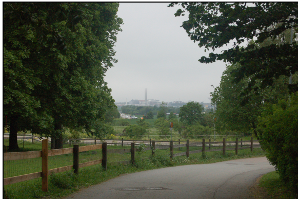
A photograph of Strešlau, taken from the Ruritanian Alps.

Ruritania is a small (62 mi 2 ; 161 km 2 ) land-locked state in central Europe. It is located between southern Germany (Saxony) and western Czech Republic (Bohemia). The land is a beautiful combination of high mountains in the west (the Ruritanian Alps) and rolling farmland in the east (the Ruritanian Veldt).