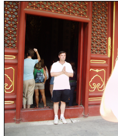
A photograph of HE Václav od Plzeňa, Ruritanian Ambassador to the United States, on an official visit to the People's Republic of China in 2006.

The old king finally died. The circumstances are a bit hazy. Official word from Řuritě Noviny holds that the king died in his sleep. However, our sources tell us that the king's body was found on the floor of the garage with flecks of foam around his mouth. The heir-apparent, Rudolf V, is not releasing the body for examination; he asserts that it would be desecration of the memory of his grandfather, especially as the old king died naturally in his sleep.